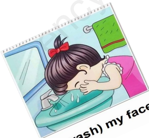
(to wash) my face