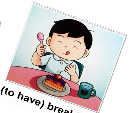
(to have) breakfast