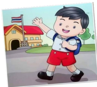
(to go) to school