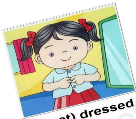
(to get) dressed