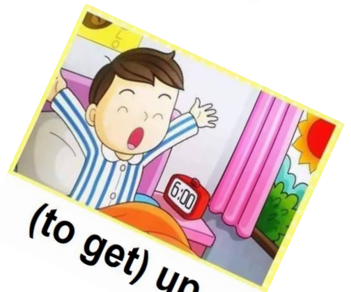
(to get) up