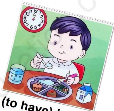
(to have) lunch